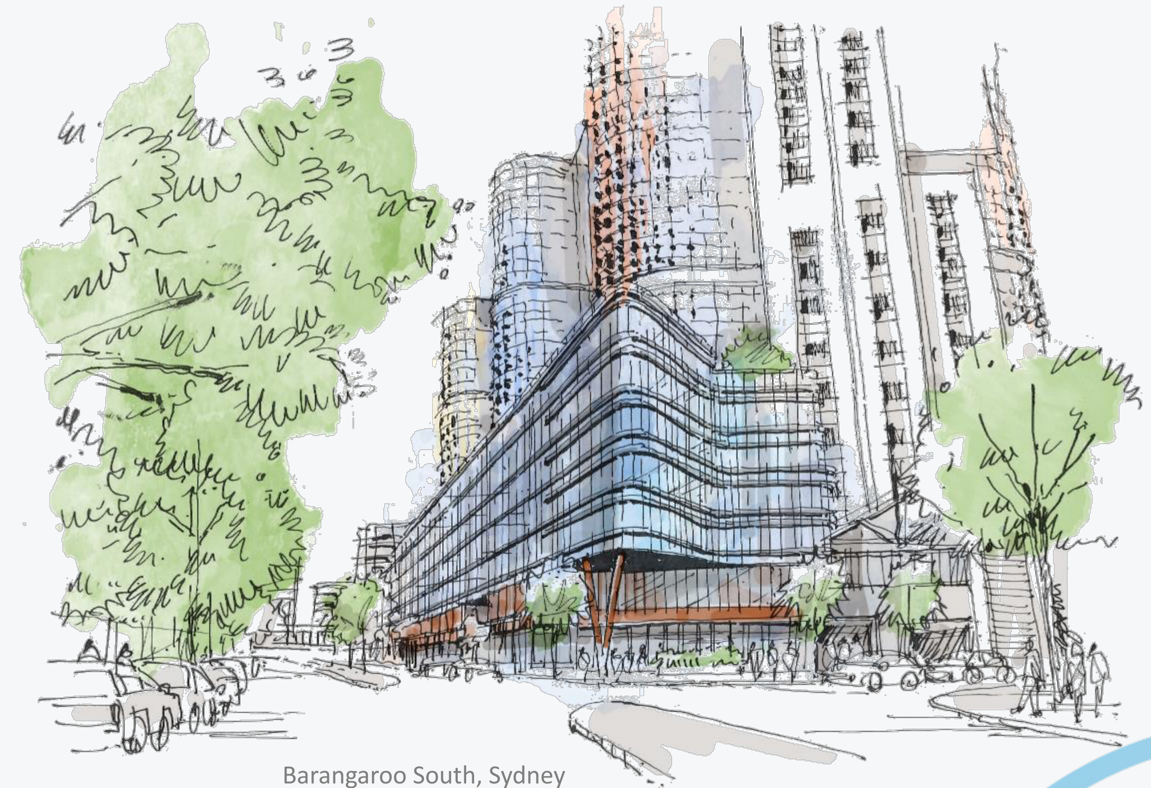
Barangaroo South, Sydney

The practice also has a direct professional association with the architecture and urban design practice Studio GL. Therefore, we can uniquely link urban and regional planning services with urban design, architecture and community engagement if and where required by a client.