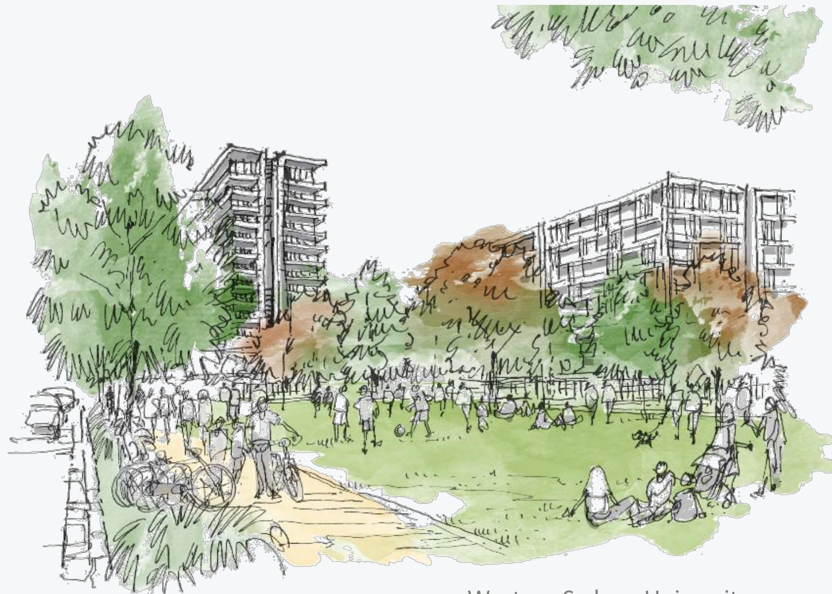
Western Sydney University

Client: Western Sydney University C/- Architectus