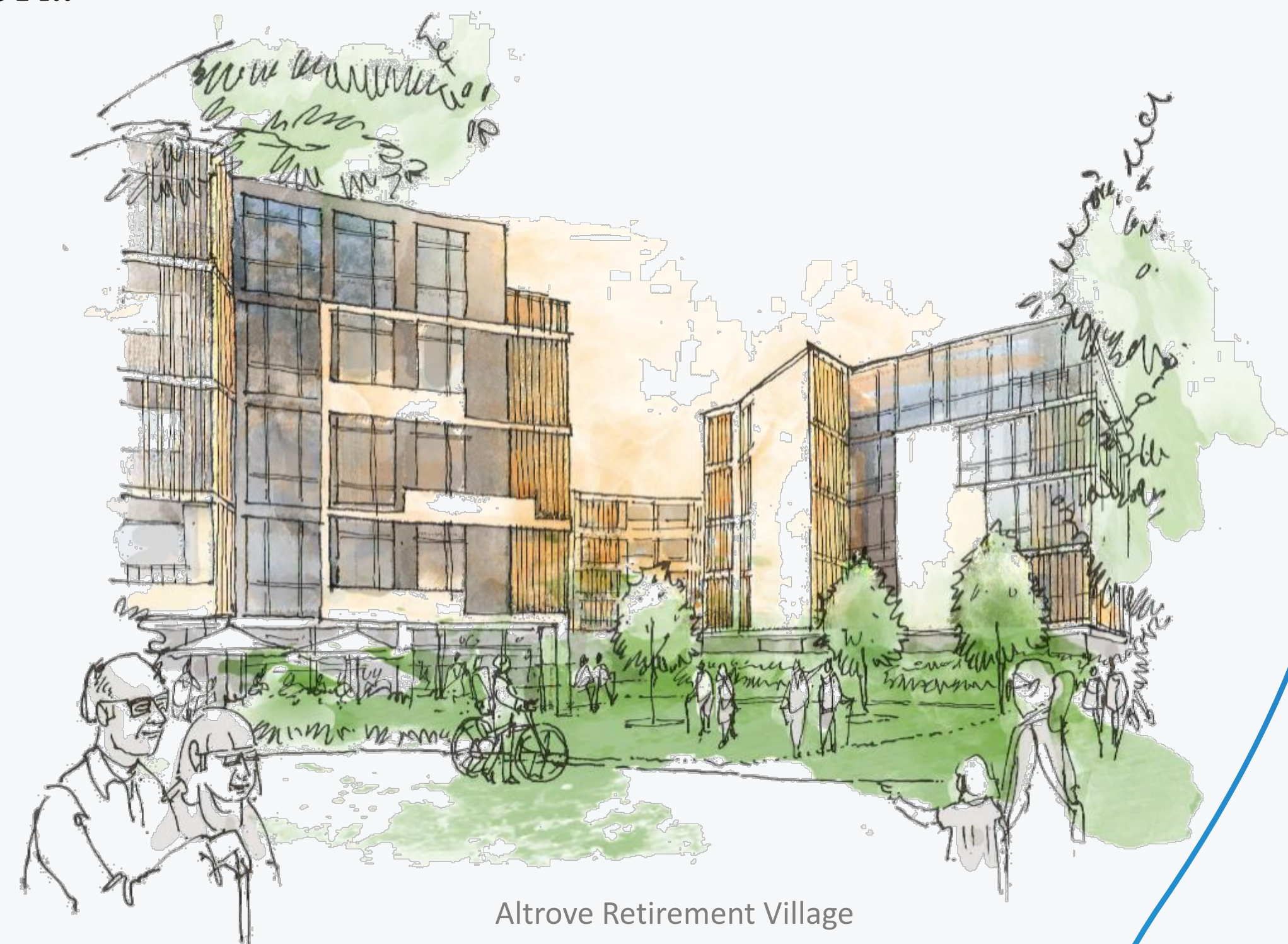
Altrove Retirement Village