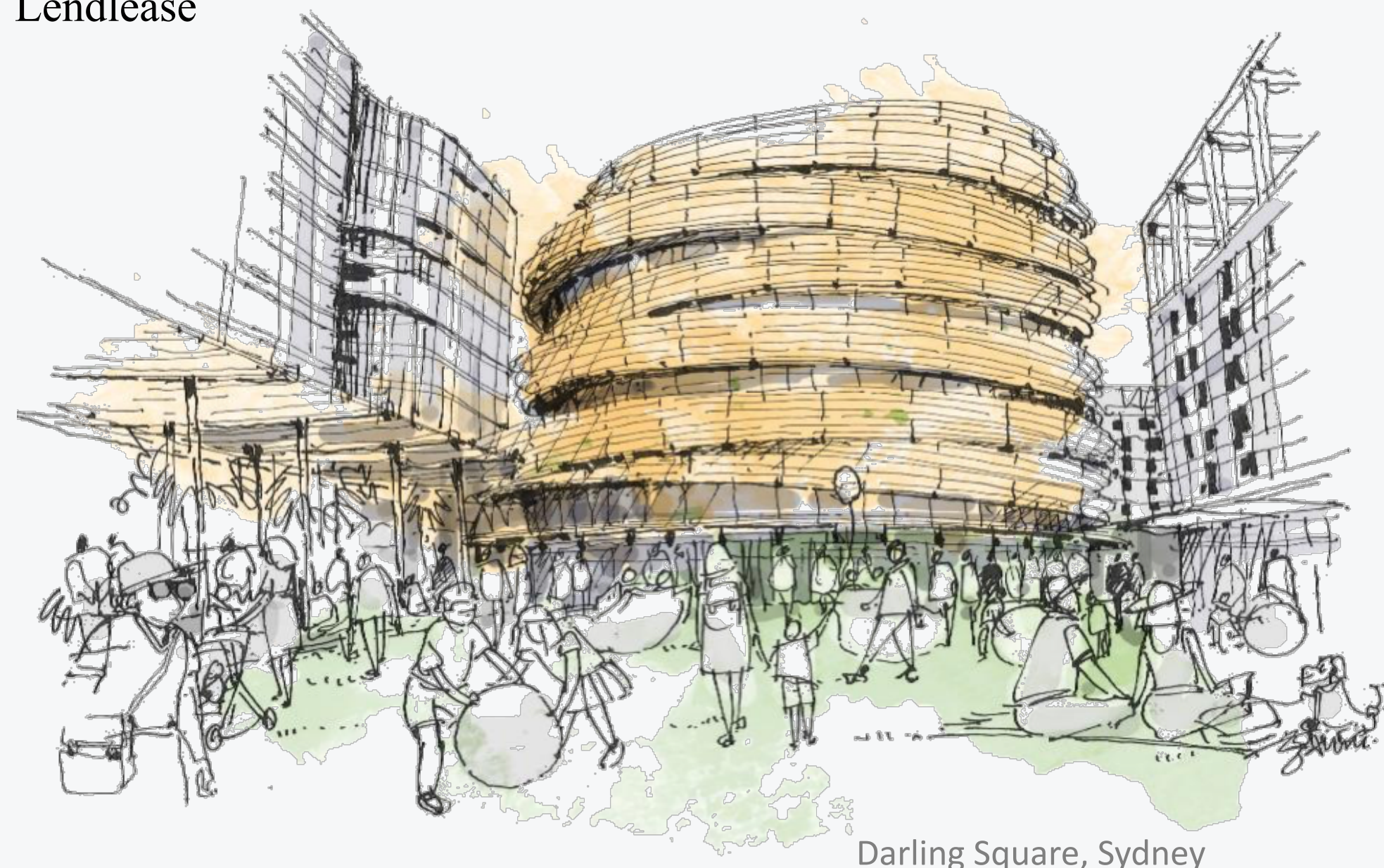
Darling Square, Sydney