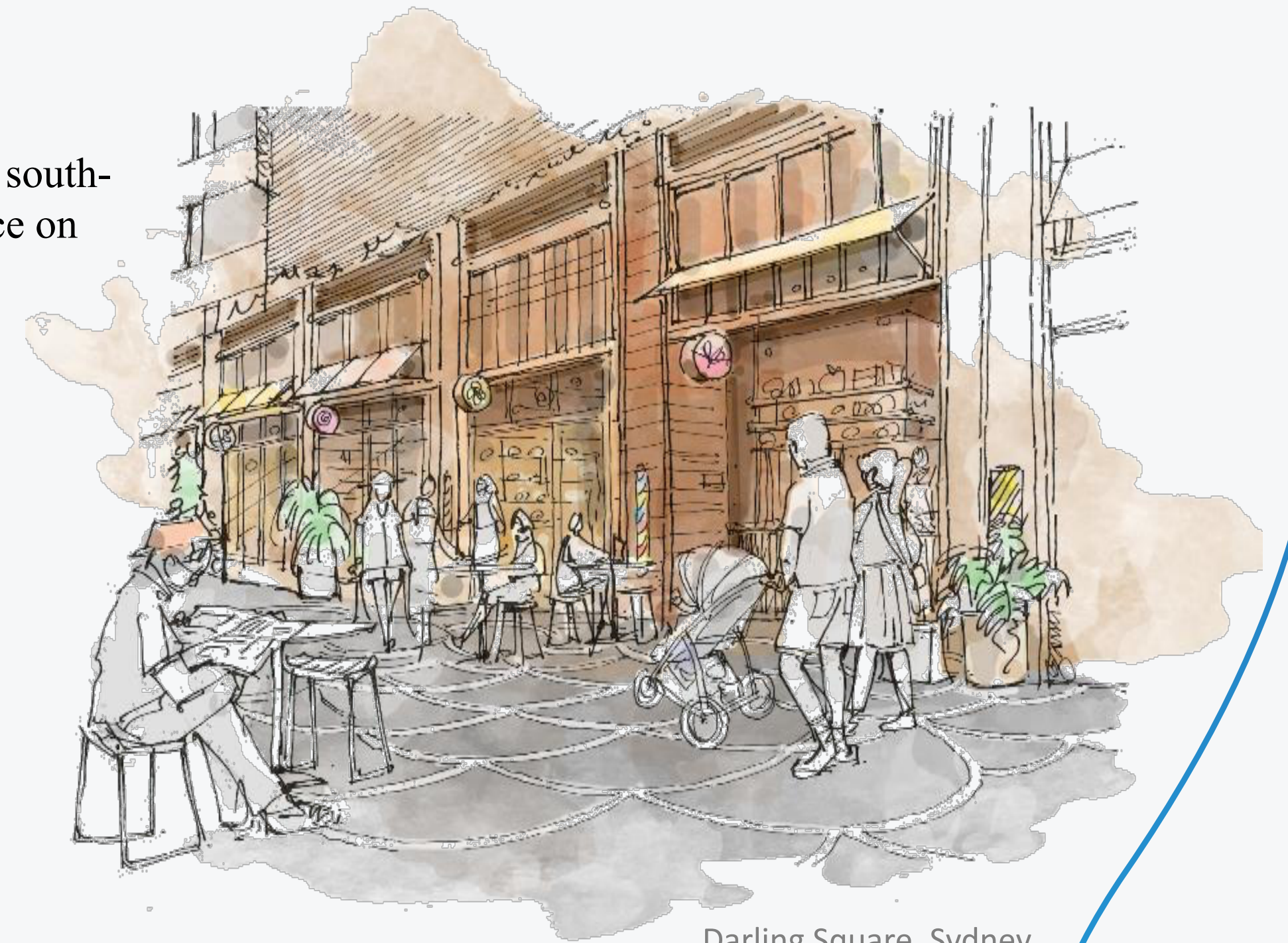
Darling Square, Sydney