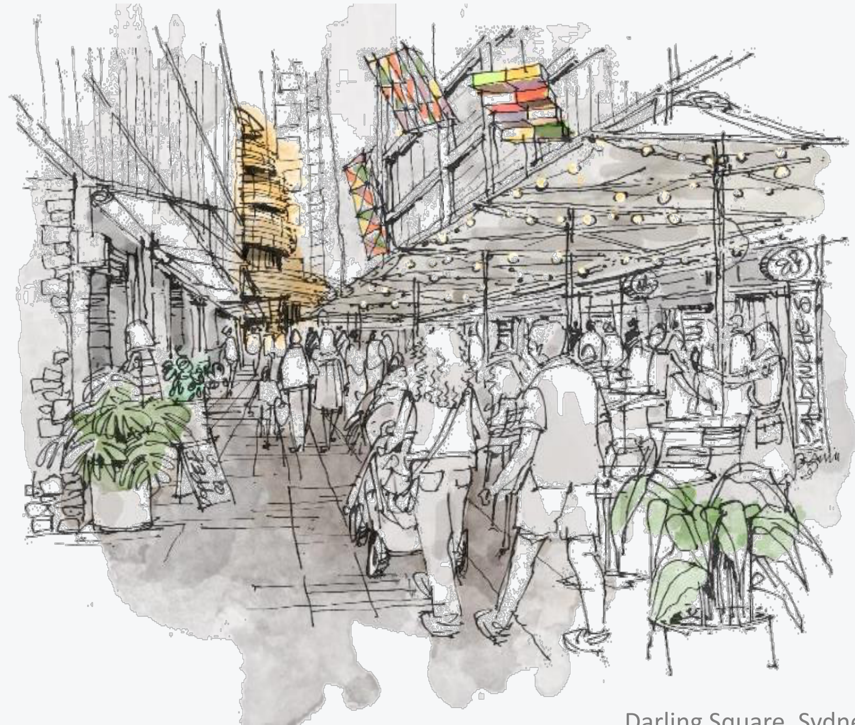
Darling Square, Sydney