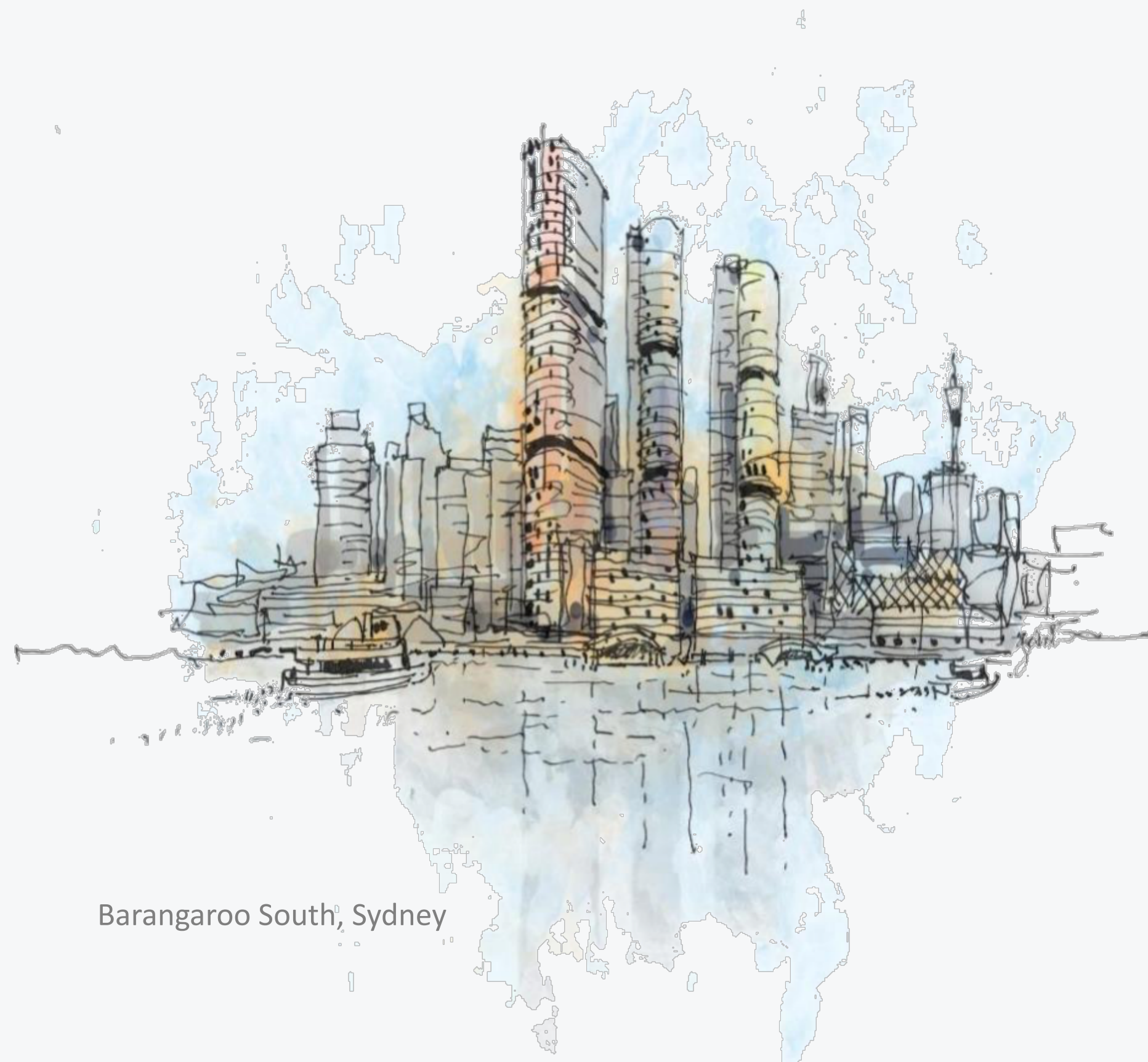
Barangaroo South, Sydney

Supporting the practice is a range of business operational services including accounting, legal, secretarial, IT and graphic design.